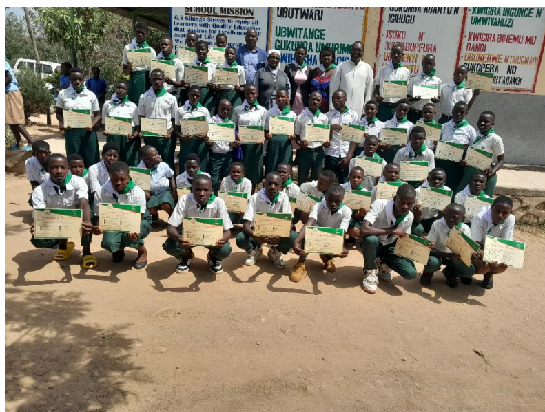
Gwizamahoro club GS Gihinga

The training of gwizamahoro clubs members lasts between 40 and 60 hours and the laureates make the vow of Non-Violence, before receiving their certificates. This year 2023, in 15 secondary schools in the District of Bugesera (Eastern Province and Nyarugenge, Kigali City), more than 500 young people made their vow of Non-Violence and received their certificates of recognition as peacebuilders in their respective communities.