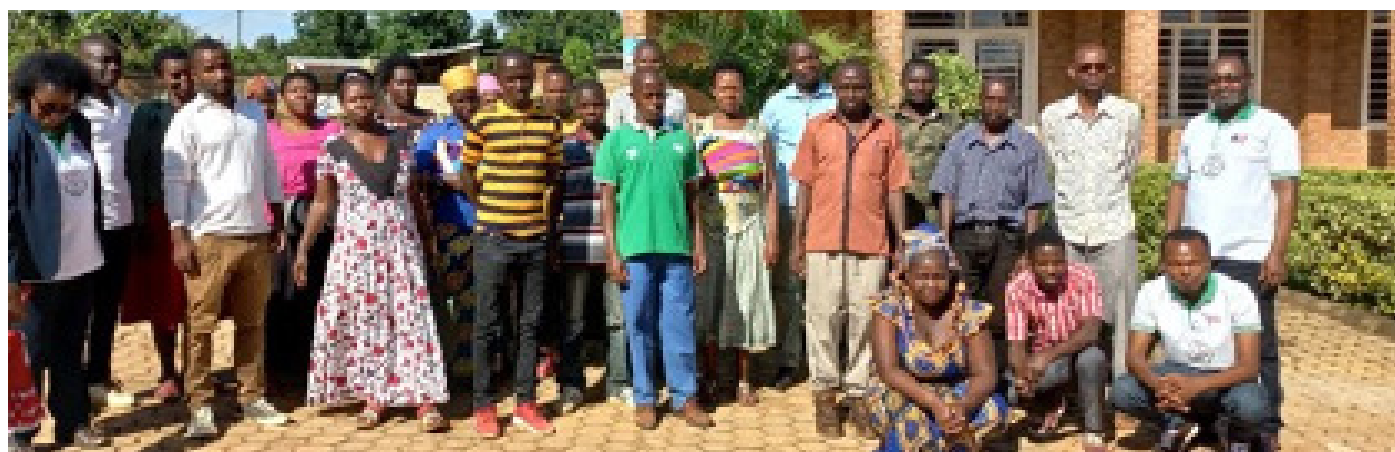
Representatives of savings groups And credit of the districts of Nyarugenge and Gasabo, in the coordination meeting (At the AJECL headquarters)

Apart from the 12 savings and credit groups in the districts of Rulindo and Gakenke, supported as part of the project: Strengthening of entrepreneurial and organizational capacity of 12 SILCS, AJECL supports 11 savings and credit groups in the district of Nyarugenge, 2 in Gasabo district and 2 in Bugesera district.