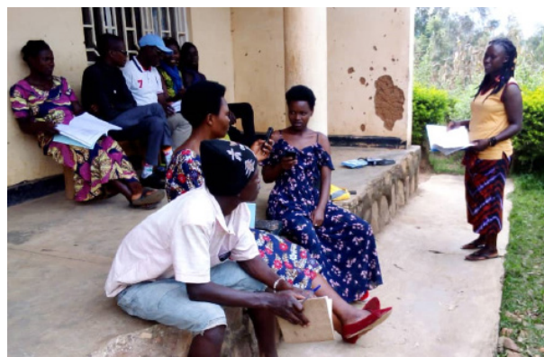
Training for members of savings and credit groups

The authorities of the two districts appreciated the quality of the training given to the representatives of the savings and credit groups of their districts and encouraged these trainers to put their heart and soul into training the members of their groups and significantly reduce youth poverty in the said districts. Until the end of 2023, 136 members of 6 savings and credit groups in the Rulindo district and 137 members of 6 groups in the Gakenke district have benefited from the training, which has built these groups in the two districts.