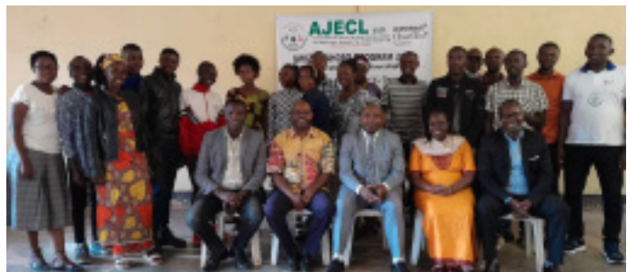
Closing of the training of trainers in Gakenke district

Strengthening of entrepreneurial and organizational capacity of 12 SILCS, funded by Lemonaid&ChariTea Foundation of Hamburg in Germany, AJECL trained 39 trainers including 20 from Rulindo district and 19 from Gakenke district.