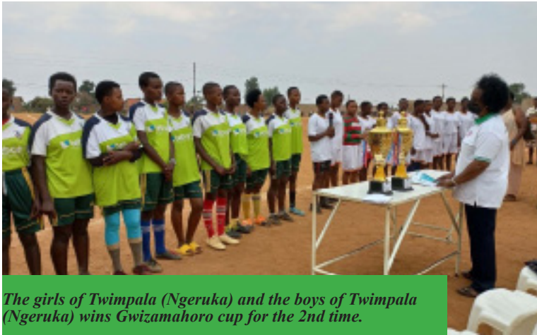
The girls of Twimpala (Ngeruka) and the boys of Twimpala (Ngeruka) wins Gwizamahoro cup for the 2nd time.

As part of promoting the culture of fraternity and peace among the young people of the 21st century, AJECL organized the football competition for boys and girls. This Annual competition is organized in the Catholic parish of Ruhuha covers, this year, 5 sectors of Bugesera district namely Ruhuha, Ngeruka, Nyarugenge, Shyara and Mareba. Each sector had a girls' team and a boys' team. The central theme of the competition is: "We, the elders of the 21st century, do not want to grow in hostility but in friendliness."